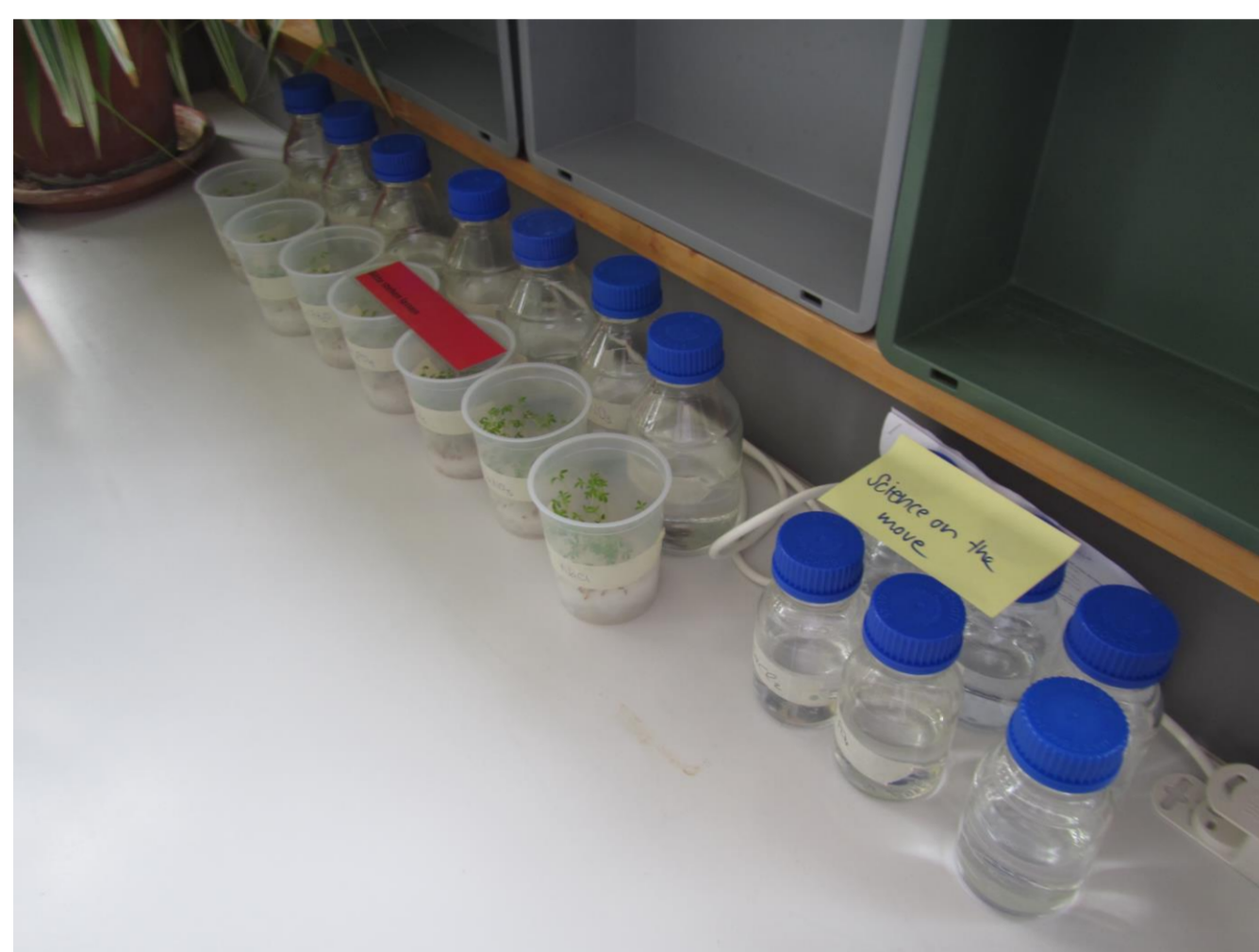
Figure1: Root laboratory

The functions of a root are the detention and inclusion of nutrients, the detention of water and it anchor the plant in soil. The water and mineral salt intake is only in the root hair zone. Root hairs are thin, only a few millimeters long threads. They squeeze into the soil particles and increase by their huge numbers the root surface. Water is absorbed by osmosis into the root hair. The water particles migrate from the site of their high concentration (ground water) to the place of their low concentration (cell sap vacuole). Roots can also actively create a root pressure to get the water to the top. The root can leach the nutrient from the soil with three methods. The first method is the absorption of aquatic nutrients. The second proceeding is the transfer of an organic acid, which leach the mineral salt from the soil. The last possibility is that root gives out some hydrogen-cations to promote the exchange of ions. Furthermore, roots are a place synthesis for many plant hormones. In swamp or mud growing plants form roots systems, which supply the plant with oxygen.